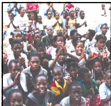
Bible teaching in a village