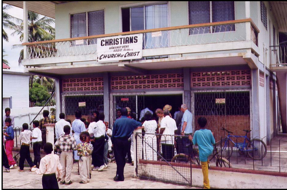
The congregation and meeting place at Rose Hall/Williamsburg.