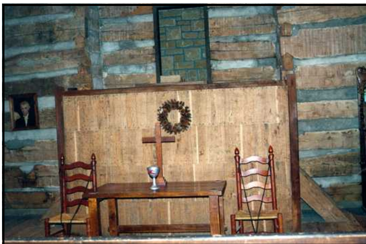
Inside the Cane Ridge meeting house.

Please take a moment to read this document (on the pages which follow), in which the writers sought to abolish their denominational structures and be “Christians only.” Pray that we will be devoted to be “Christians” rather than members of a denomination.